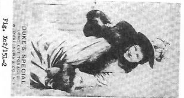
Fig. Xo2/151-2 DUKE'S SPECIAL LONG CUT TOBACCO W. DUKE, SONS & CO., N.Y.