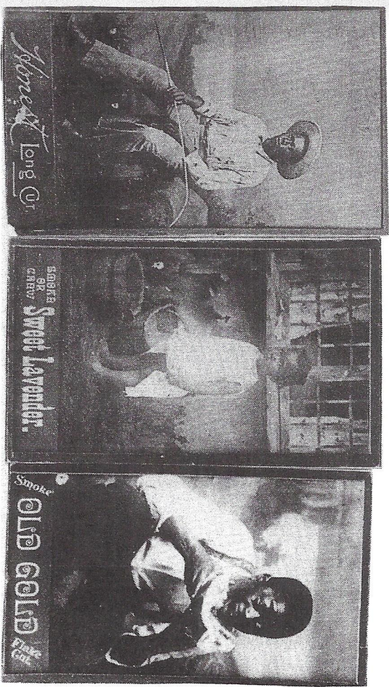
1 2 3 Fig. Xc2/157