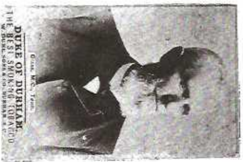
DUKE OF DURHAM. THE BEST SMOKING TOBACCO W. DUKE, SONS & CO., DURHAM, N.C. Fig. Xc2/146