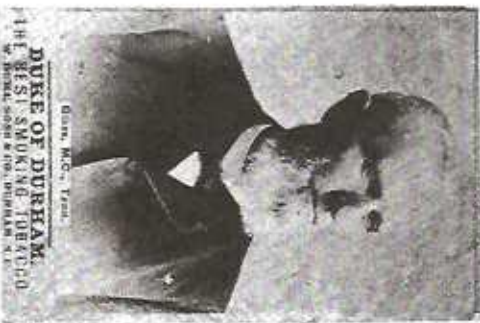
DUKE OF DURHAM THE BEST SMOKING TOBACCO W. DUKE, SONS & CO., DURHAM, N. C.